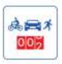
TRASSIR Neuro Counter