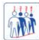
TRASSIR Queue Detector