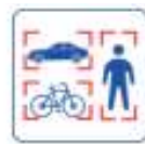
TRASSIR Neuro Detector