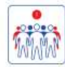
TRASSIR Crowd Detector